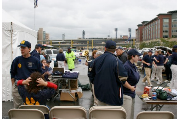
Alumni enjoy the tailgate before the game.

The Pitt Band Alumni Council in conjunction with the University of Pittsburgh Varsity Marching Band held its annual Band Alumni Day on September 23, 2006. The Panthers squared off against the Citadel and won 51-6. The event was a fun filled day enjoyed by the fans, families and most importantly the Band Alumni. As usual, the day began with the most crucial segment of Alumni Band Day: the tailgate. Food, cake and tasty beverages were