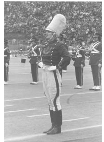
Game day 1976