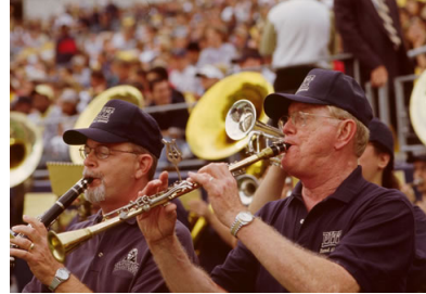
Alumni Band Day 2002

There is a change in the format of Alumni Band Day this year. Based on conversations with band alumni of all ages, our goal is to provide additional opportunities for playing music and socializing. There will be an optional music rehearsal Friday night after the Varsity Band finishes rehearsing. On Saturday, there will be a tailgate, pre-game concert and parade with the Varsity Band. During the game the Alumni Band will sit with family and friends and instruments in a block of seats à la visiting band.